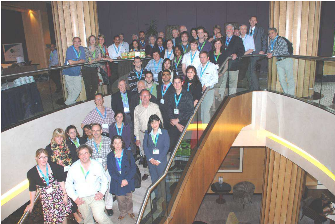
The Neutrons and Food workshop was truly an international meeting with attendees coming from both academia and industry.