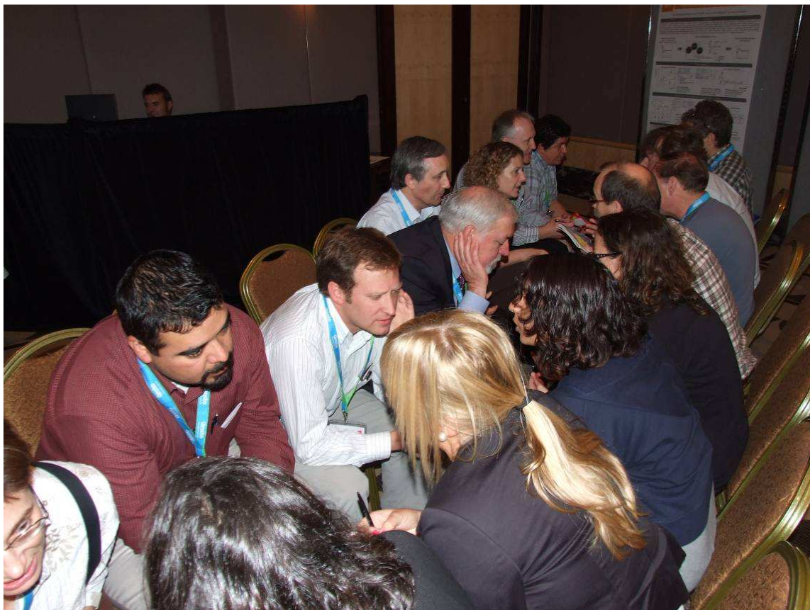
Speed networking – Food materials scientists on the left and neutron scatterers on the right.

from North America (USA, Canada), 4 from New Zealand and 3 from Asia complementing 21 participants from Australia (see appendix for list of participating institutions). The speed networking session on the first day greatly enhanced interaction and discussions. The social networking continued at the workshop dinner with a cruise on Sydney harbour. A visit to ANSTO's neutron facilities was offered at the end of the workshop.