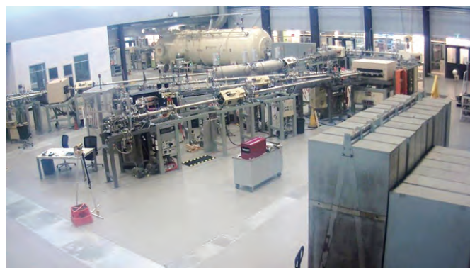
Fig. 2: ANSTO’s new 6 MV SIRIUS accelerator and its associated ion-beam analysis and accelerator mass spectrometry beamlines.

In support of these accelerators, ANSTO operates chemistry laboratory facilities for preparation of samples prior to applying high sensitivity accelerator-based analysis techniques and state of the art uranium series laboratory facilities for ultra-sensitive isotopic analyses. This science platform is at the forefront of ion beam analysis, accelerator mass spectrometry and accelerator instrumentation, and caters for a wide range of research applications, from archaeology, climate change and energy materials, to radiation detectors, nuclear safeguards and zoology. It is used by internal, domestic and overseas researchers, with approximately 40% of running time used for ANSTO internal research and 60% for externally driven research and commercial activities.